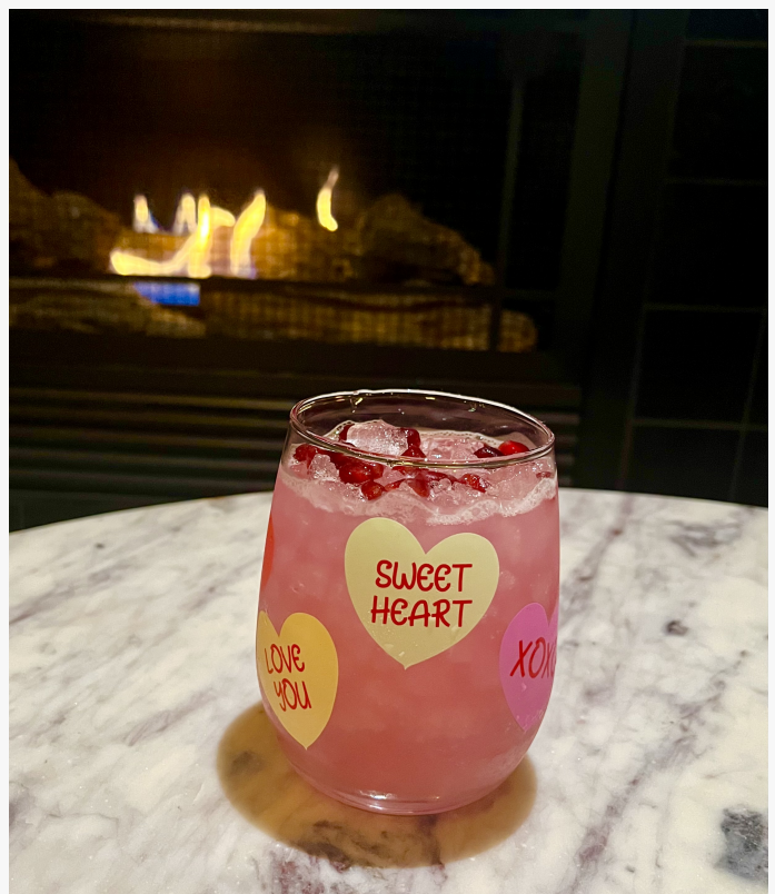
Tunnel of Love Cocktail at The Dandy Crown