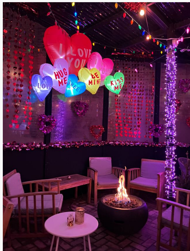
Tunnel of Love at The Dandy Crown Fireside Table