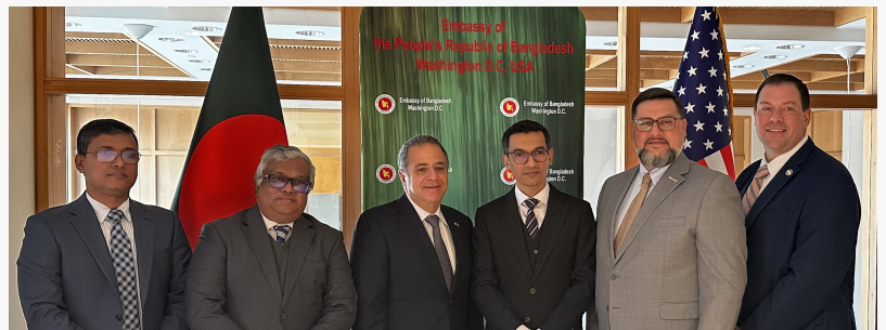
Bangladesh Signing DC Embassy