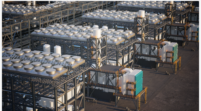
Argent LNG - Baker Hughes