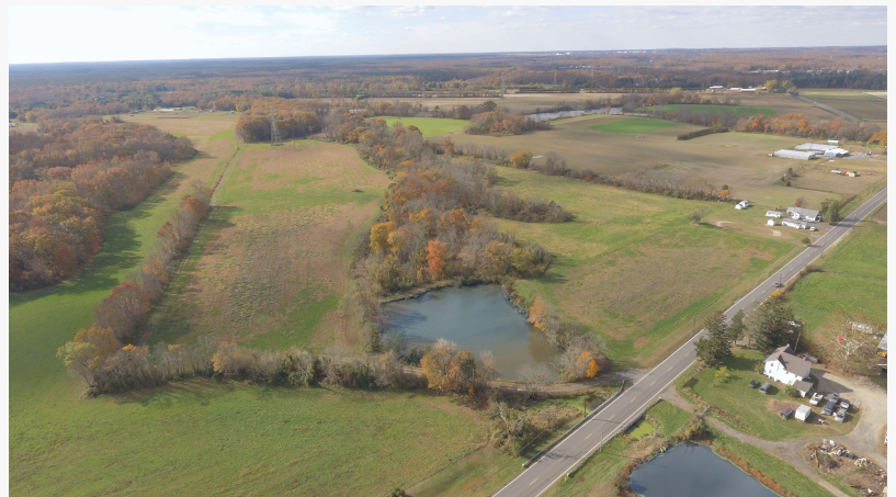
Huie South Farm 94.71+/- Acres