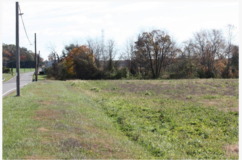
Excellent Visibility & Road Frontage

□The properties will be sold individually in a live Auction on Thursday, February 12, 2026 at 10:00AM at the Ocean County Administration Building located at 101 Hooper Avenue, Toms River, NJ 08753. Interested Bidders may attend the Auction live or participate remotely through Max Spann’s online bidding platform and smartphone app. A Property Information Package , including maps, preservation details, auction terms, and bidding instructions, will be available prior to the auction by visiting www.maxspann.com .