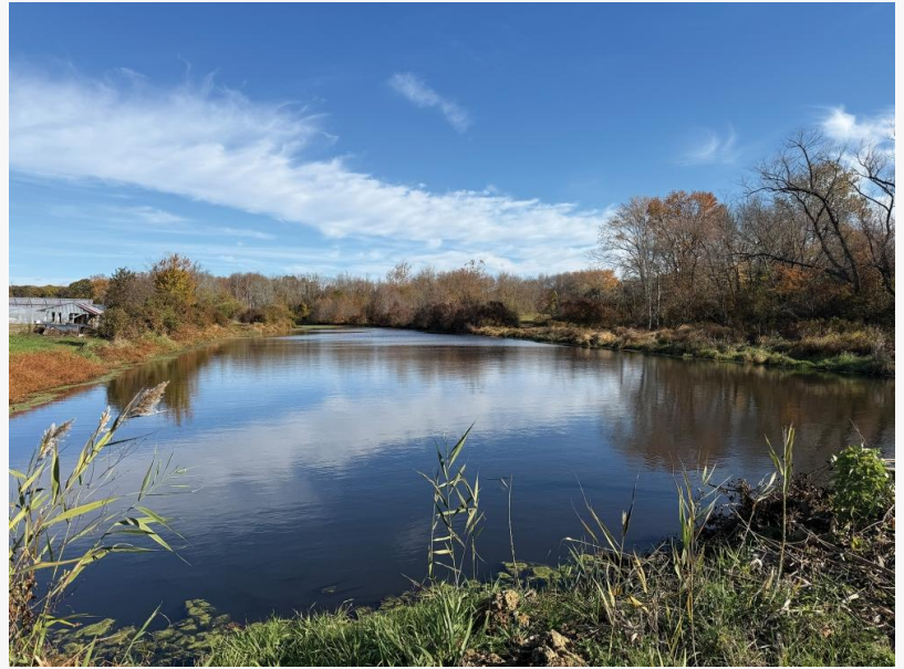
Ponds on Both Farms