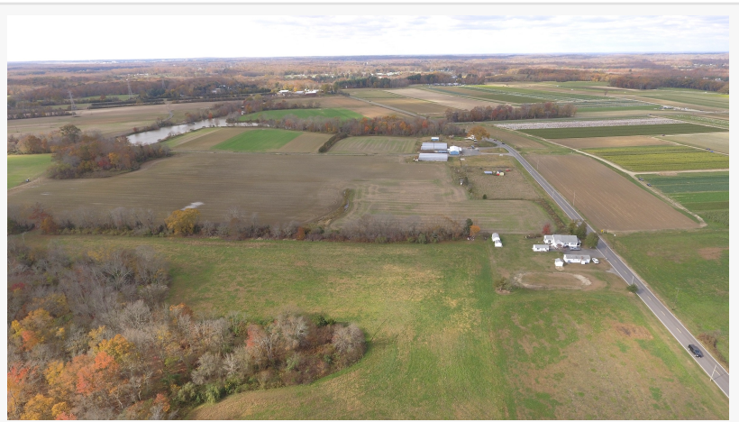
Huie North Farm 98.33+/- Acres