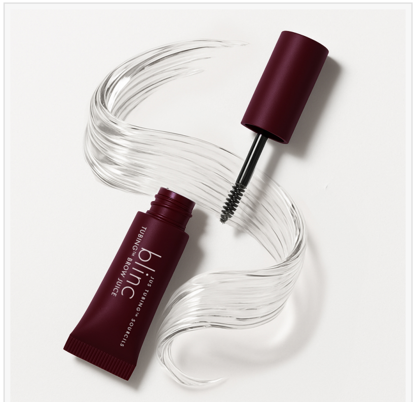
Tubing™ Brow Juice by blinc - a clean, multitasking brow shield that delivers lasting hold and a soft lamination effect.

conditioning and protecting brows from daily stress.