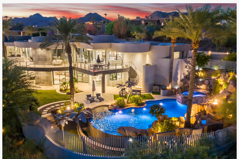
Paradise Views: 6021 N. 44th St, Paradise Valley, AZ 85253

PARADISE VALLEY, AZ, UNITED STATES, January 12, 2026 /EINPresswire.com/ -- Interluxe Auctions, the premier online luxury real estate auction marketplace, is pleased to announce the upcoming online auction of Paradise Views, a one-of-a-kind 9,564± sq. ft. contemporary residence on 1.45± acres in the heart of the ultra-luxurious Paradise Valley. With floor-to-ceiling elliptical glass walls providing unobstructed views of Camelback Mountain and Echo Canyon, this home provides a private desert setting while remaining minutes from world-class golf and luxury resorts, including Sanctuary Camelback Mountain and Camelback Golf Club, as well as Steak 44, Scottsdale Fashion Square, and Phoenix Sky Harbor International Airport.