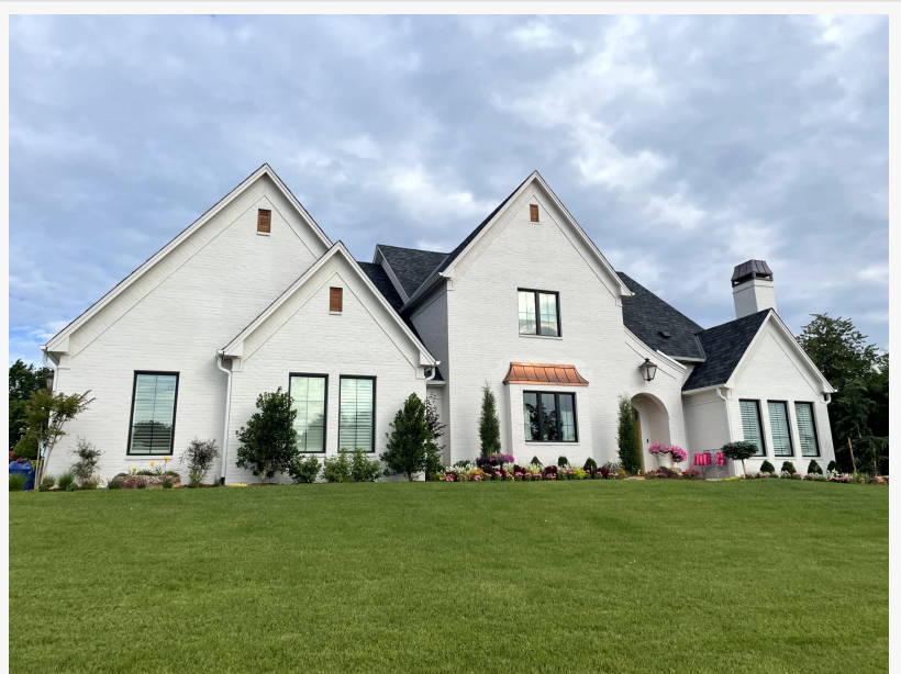
Exterior Painting in Oklahoma City

Painting is more than a cosmetic upgrade. A well-executed paint job protects surfaces from wear, moisture, and sunlight, helping to preserve siding, trim, and interior walls. Homes in Oklahoma City and surrounding areas face a range of seasonal stresses hot summers, cold