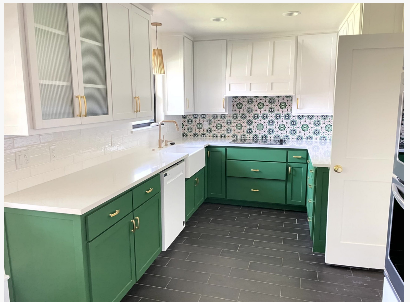
Cabinet Painting in Oklahoma City