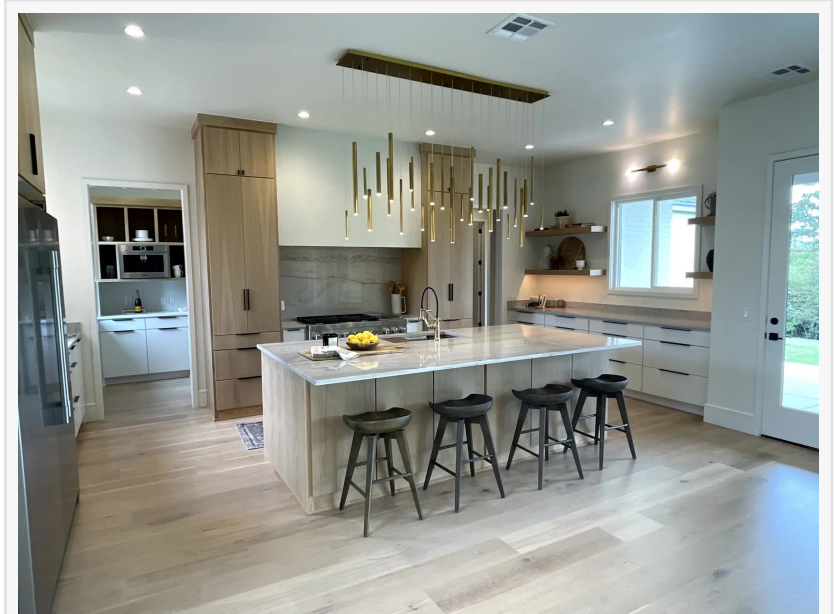
Interior Painting in Oklahoma City

Winter weather in central Oklahoma often means cooler temperatures, wind, and occasional precipitation that can delay or complicate outdoor painting work. While exterior painting may not be practical in the coldest weeks, that doesn't mean homeowners need to wait passively. Instead, OKCity Painting suggests using January through March to look ahead. This planning period allows people to evaluate their homes, consider likely needs, and arrange logistics ahead of busier painting seasons.