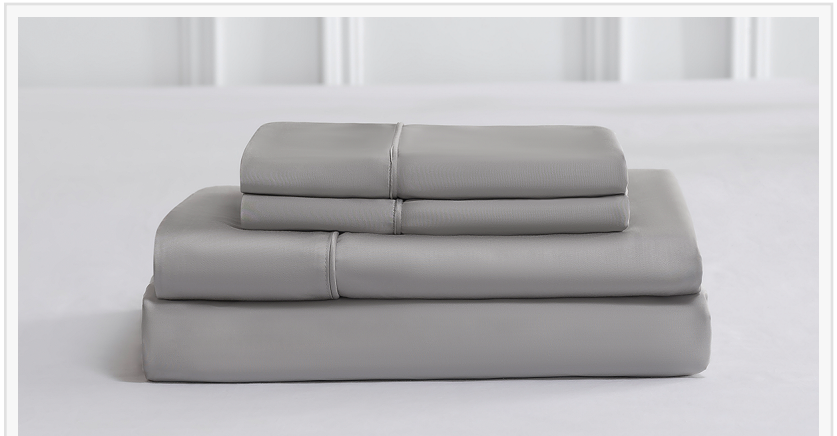
(new) Bamboo Viscose Sheet Set