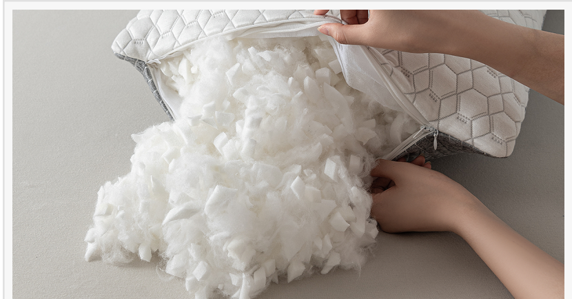
(New) Bamboo Essense Pillow

BELOIT, WI, WI, UNITED STATES, January 15, 2026 /EINPresswire.com/ -- The Beloit Mattress Company announced today the launch of a curated line of premium bedding accessories designed to enhance comfort, support cleaner sleep, and help protect mattresses from everyday wear. The collection expands the company's role from a factory direct mattress maker to a full sleep protection provider serving Wisconsin and Illinois, with mattress delivery up to 300 miles and nationwide accessory shipping.