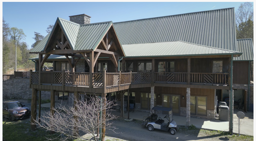
Xplore Recovery House