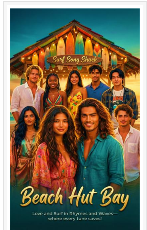
Official poster for Beach Hut Bay, a Hawaii-set romantic comedy musical from Power Star Entertainment's International Creative Think Tank.

The plot builds toward the annual "Moonlight Musical Mashup," a competitive event where friends and rivals perform under the night sky. Tensions escalate when a mysterious theft disrupts the Surf Song Shack, prompting Koa and Sienna to team up with an eclectic group of friends. Their search for answers unfolds through beach parties, talent showcases, and musical