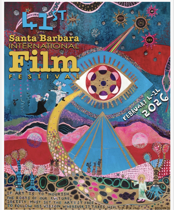
Santa Barbara International Film Festival

This press release can be viewed online at: https://www.einpresswire.com/article/883058829