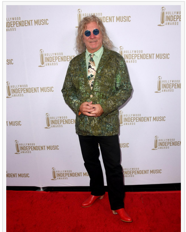
Hollywood Independent Music Awards

IMBALANCE , a new independent feature film written and directed by Dale Griffiths Stamos, delivers a captivating examination of the pull between passion and reason. Set against the