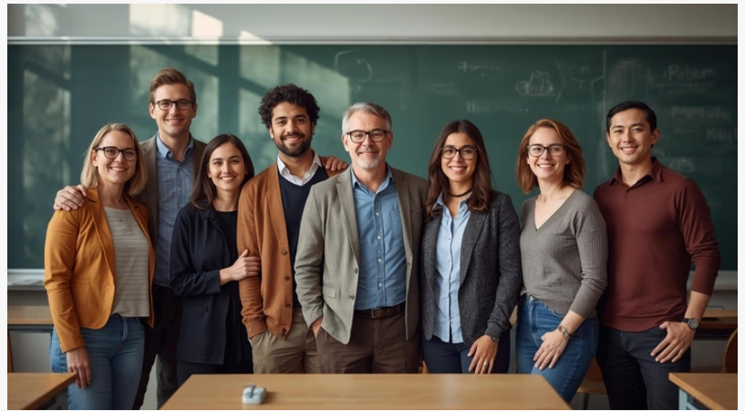
Plag Eliminates Cost Barriers for Academic Integrity

VILNIUS, LITHUANIA, January 15, 2026 /EINPresswire.com/ -- Multilingual Platform Serving 129+ Domains Provides Teachers, Professors, and Lecturers Unlimited Access to Advanced Plagiarism Detection and AI Content Analysis.