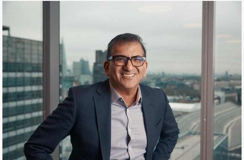
Building Agentic AI Expertise for the UAE's Innovation Economy

LONDON, UNITED KINGDOM, January 15, 2026 /EINPresswire.com/ -- Bell Integration, a global leader in AI transformation, IT modernisation, and digital services has announced the expansion of its AI Training portfolio in the United Arab Emirates with the introduction of new custom Agentic AI training programmes. These programmes form a central component of Bell Integration's comprehensive AI Journey Success Programme, designed to guide UAE organisations through every phase of AI adoption—from strategy to long-term operational success.