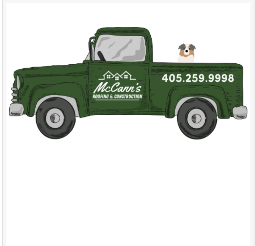
storm-damaged roof replacement