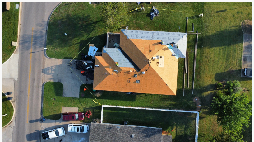
Before and after photos of a storm-damaged roof replacement in Oklahoma City

A Roofing Experience Built on Trust—Not Pressure