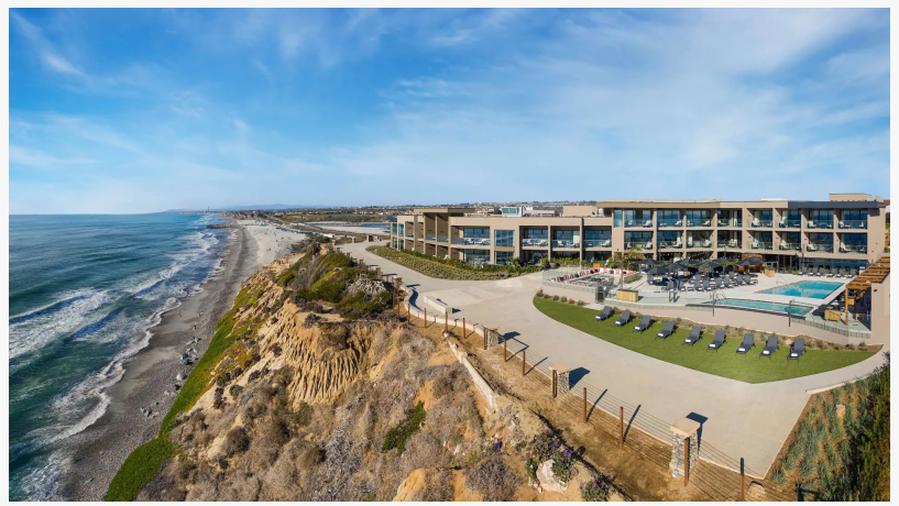
Alila Marea Beach Resort, the premier oceanfront sanctuary celebrated for its mindful luxury and seamless harmony with the Southern California coast.

Offerings include light therapy panels, molecular hydrogen inhalation for powerful antioxidant protection, and curated supplements and rituals designed to promote vitality, mental clarity, and cellular renewal—extending the transformative benefits of Lumati's technology beyond the spa and into the privacy of each guest's ocean-view sanctuary.