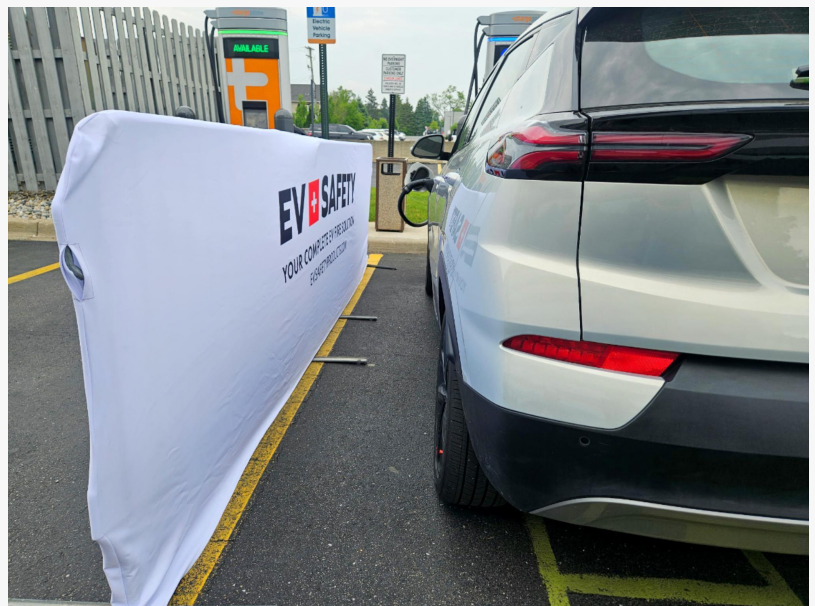
EV Safety Inc.'s FireGuard Fire Resistant Parking Barrier in action at a charging station.

Born out of necessity, EV Safety Inc. was founded by experienced executives from companies such as SpaceX, Cox Automotive and Hard Rock Hotels International. Their unique, patented