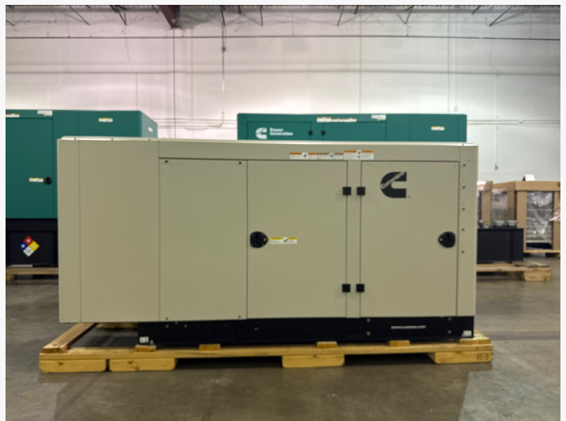
Cummins QuietConnect RS80 Ready to Ship

"Most generator dealers build 80kW and 100kW generators to order, with production timelines stretching from six months to a year," Richey explained. "We know what the market demands, which is why our units are available for immediate shipment. The RS80 and RS100 models have become customer favorites—they deliver the right capacity for typical small business requirements without the usual waiting times. When your operation needs dependable backup power, these generators are ready to go."