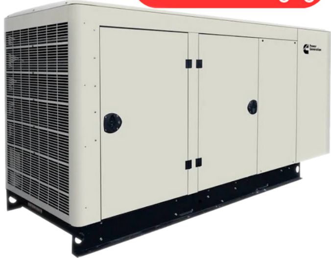
Cummins QuietConnect RS100 - In Stock, Ready to Ship