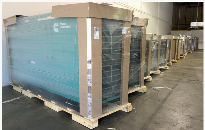
View of Cummins QuietConnect Generators in Buckeye Power Systems warehouse.