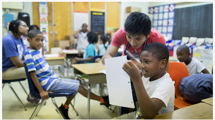
Youth and educators at the Barbara and Edward Netter Center for Community Partnerships engaged in shared learning, reflecting themes of connection, care, and responsibility.

Together, the three panelists offer distinct yet complementary perspectives, demonstrating how creativity, across multiple disciplines, serves the community as an art of expression and a