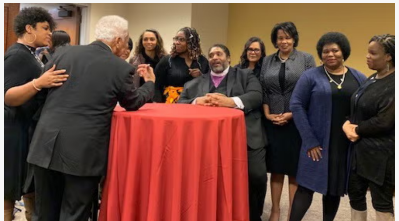
Community leaders of University of Pennsylvania's Dr. Martin Luther King Jr. gathered in conversation, reflecting on creativity and civic responsibility.