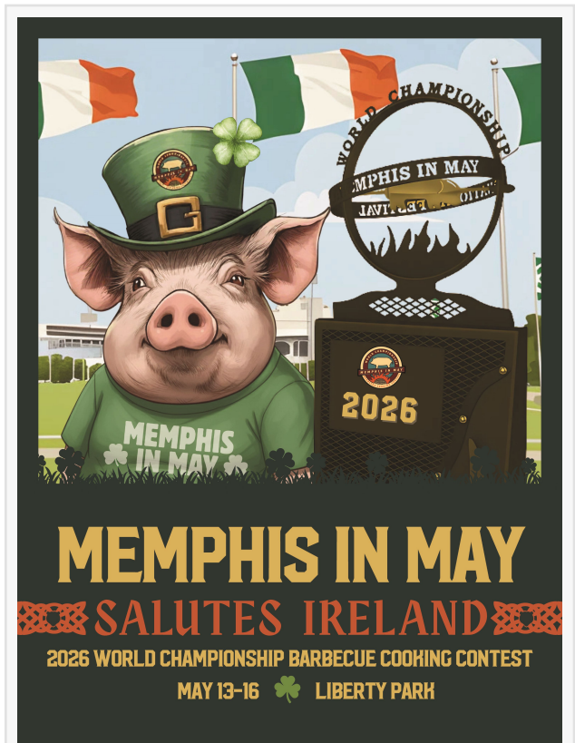
2026 World Championship Barbecue Cooking Contest Poster

Ticket options include single-day and four-day admission tickets, a VIP package option, and “combo packages” that offer fans admission to the park plus an “Ultimate Food Experience” of their choice that allows fans to taste the barbecue. The Ultimate Food Experience Combo Package Ticket Options are: