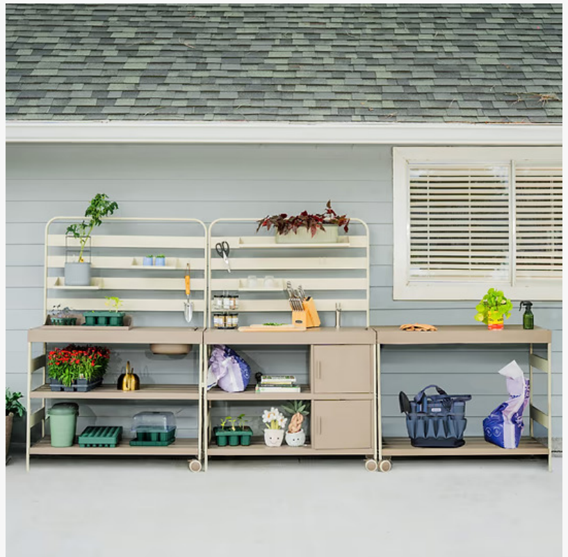
Full Patio Workstation