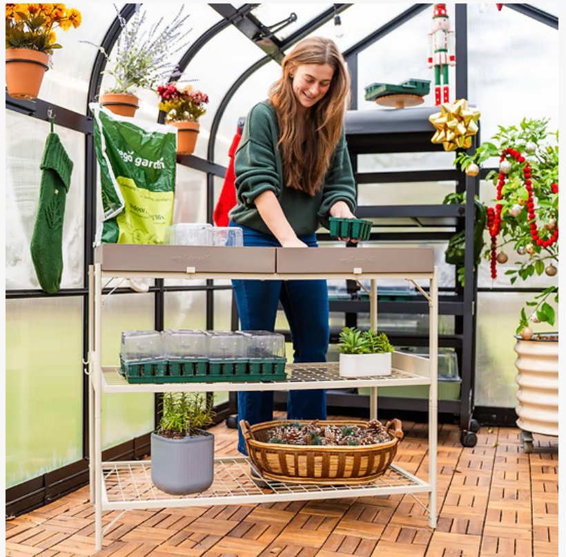
Garden Potting Table