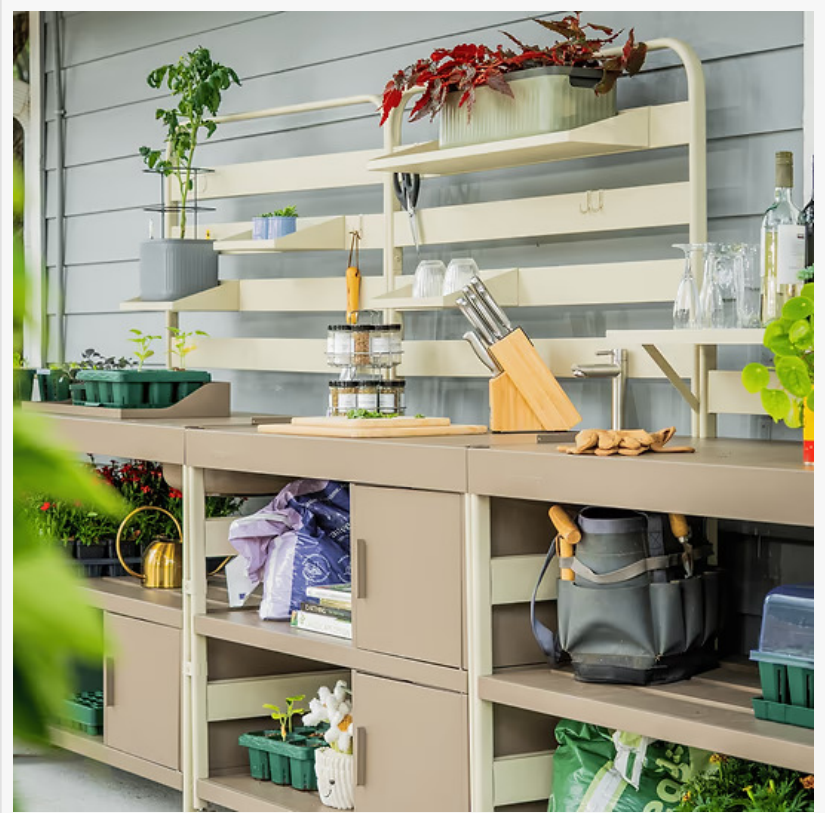
Garden Sink Station with Cabinet

Different configurations within the Potting Bench Collection are designed to support the full gardening workflow. Select models include an optional stainless steel sink paired with a steel lid that creates a flush work surface when the sink is not in use. Potting bench models feature a removable basin with lid for efficient soil handling and easy cleanup. Lockable wheels allow for flexible repositioning, while solid metal feet provide stable, anchored placement. A growing accessory ecosystem supports organization, prep efficiency, and flexible daily use.