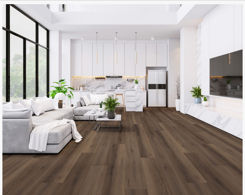
Central Florida's Flooring - Modano Floors

The highlight of the launch is Modano's innovative AI visualization tool , which lets homeowners see a realistic "after photo" of their kitchen or bathroom before making a flooring decision.