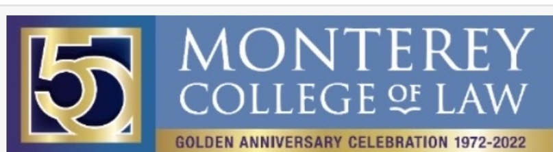
MCL 50th Logo

season is on the amazing individuals who are pursuing positive change during challenging