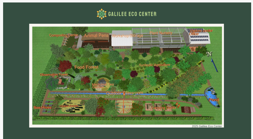
Conceptual site plan for the Galilee Eco Center's future campus, integrating regenerative agriculture, education spaces, ecological restoration, and community programming.