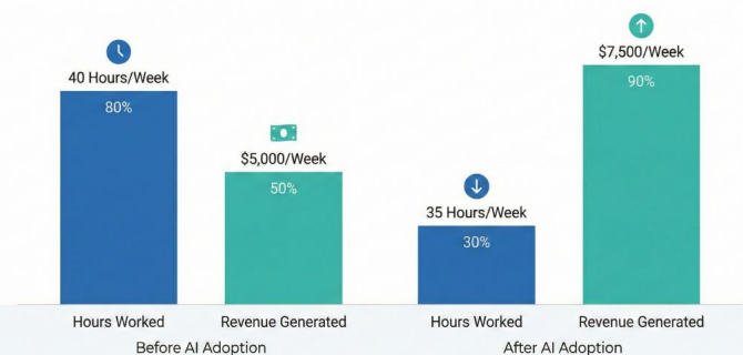
Impact of AI Adoption: Hours Worked vs. Revenue Generated

Early adopters of the "Context-First" framework report saving an average of 5 hours per week.