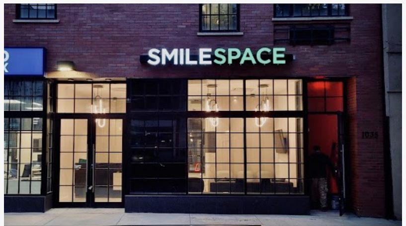
SmileSpace™ Brooklyn (Clinton Hill)