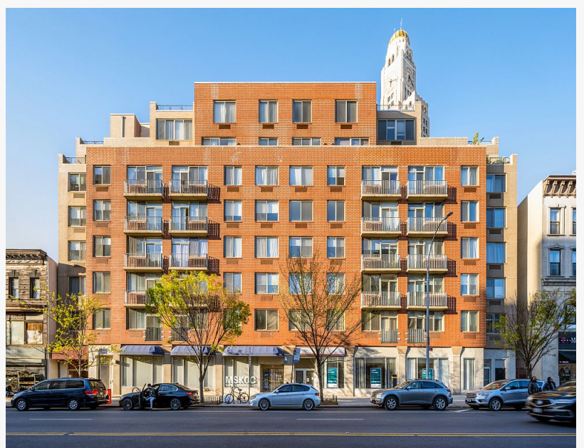
SmileSpace™ Brooklyn (Boerum Hill near Barclays Center)