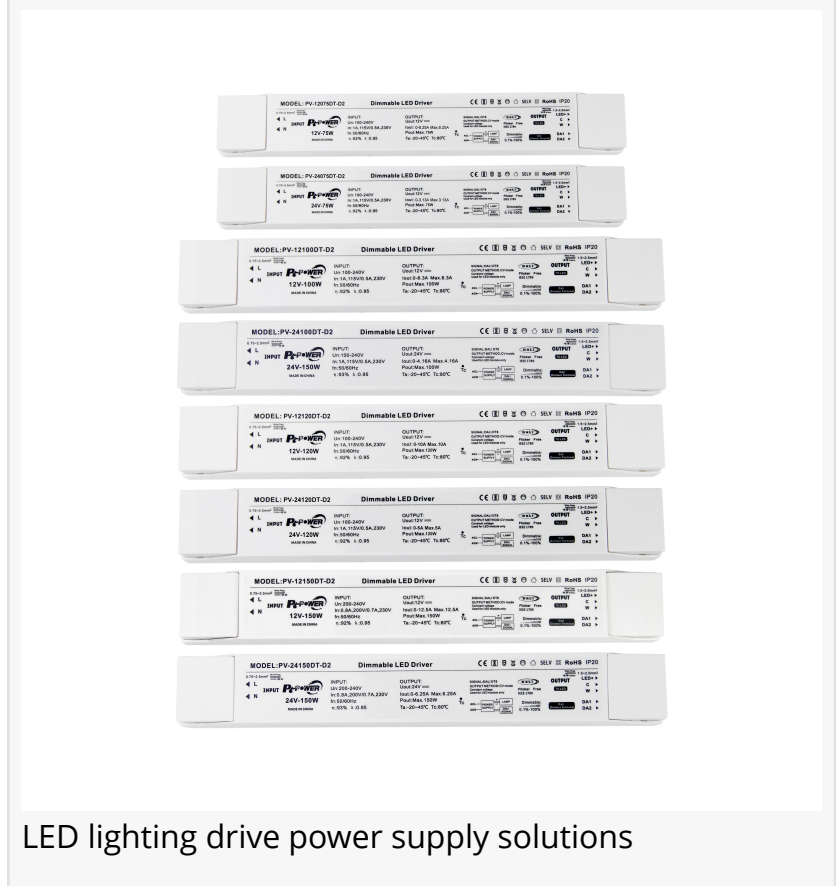
LED lighting drive power supply solutions