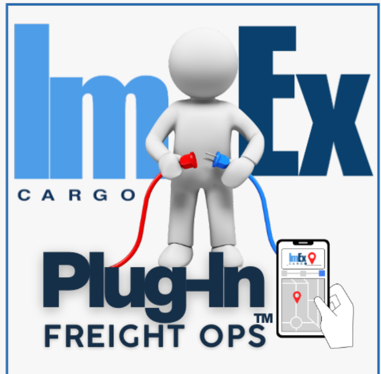
Quote Book Track- All in One Place