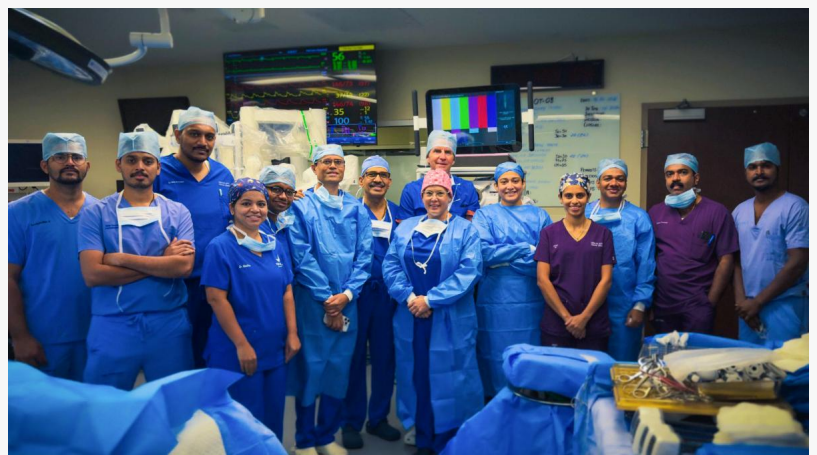
The Health City team after completing a robotic cardiac surgery