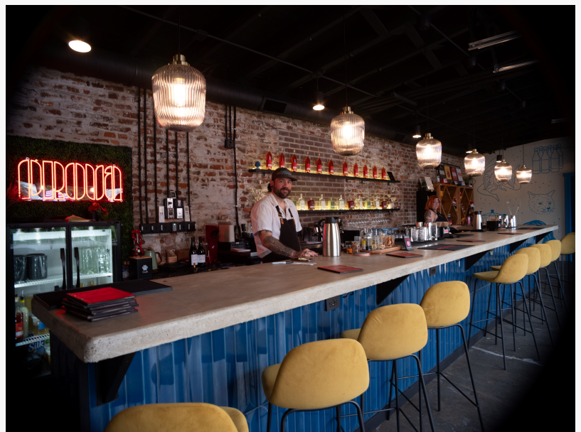
Cocktail Bar at Prova Spirits

Additionally, Prova Spirits benefits from access to specialized, high-tech equipment typically unavailable to bars that are not also licensed distilleries. This capability supports aromatic extraction and spirit development methods used to shape flavor profiles with precision. Not only that, but the company also de-alcoholizes wine in-house to support a dedicated non-alcoholic offering, aiming to provide guests with alcohol-free options that reflect the same care, complexity, and cocktail intent as the core menu.