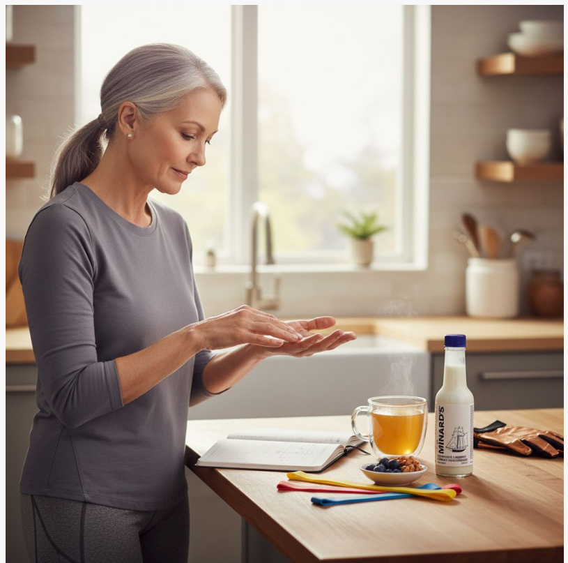
Minards Heritage Pain Relief for all ages

The persistent customer demand revealed not just individual loyalty, but broader market opportunity for authentic Canadian heritage remedies. As Canadians increasingly seek natural pain relief alternatives, heritage products with unchanged formulations represent a rare treasure in today's marketplace.