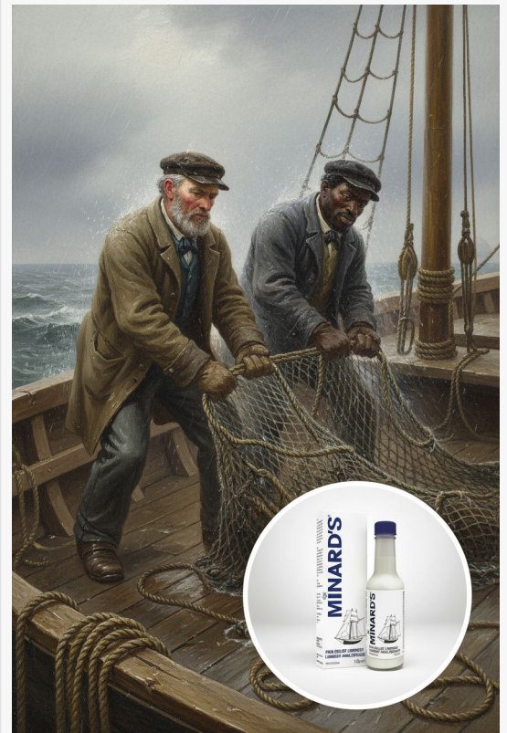
Minards Heritage Pain Relief Since 1860