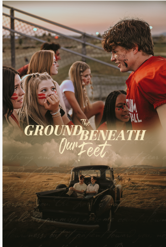
The Ground Beneath Our Feet