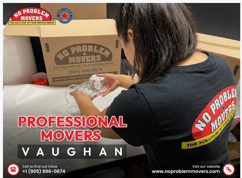
professional movers Vaughan