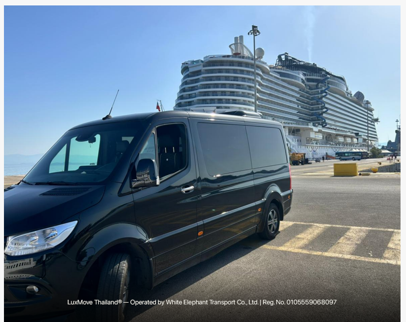
Cruise excursions start with clearance, not guesswork

Laem Chabang: An Operational Environment, Not a Standard Pickup Point