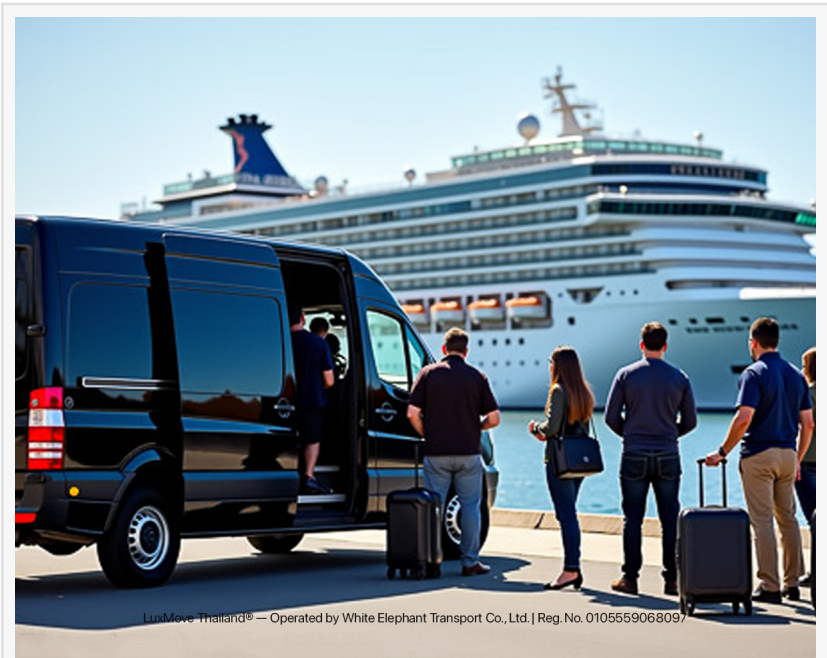
When timing matters, experience shows

When properly executed, passengers transition smoothly from ship to vehicle — even on high-volume port days.