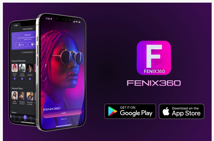
FENIX360 - GEM Global Yield

Under the terms of the agreement, upon Listing, FENIX360 may, at its sole discretion, issue registered and freely tradable common shares to GEM over the investment period, subject to customary conditions. The structure enables FENIX360 to control the timing and amount of capital drawn, aligning funding with corporate milestones and market conditions. As part of the transaction, FENIX360 has also