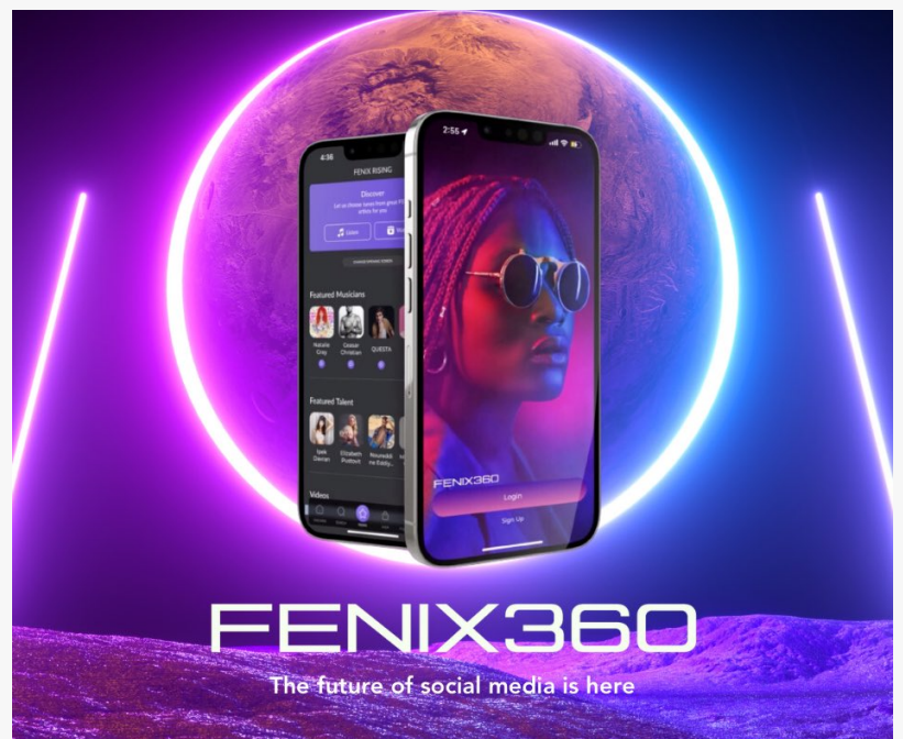
The FENIX360 App