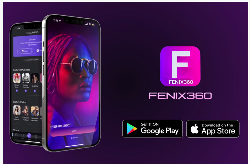
FENIX360 - GEM Global Yield

Under the terms of the agreement, upon Listing, FENIX360 may, at its sole discretion, issue registered and freely tradable common shares to GEM over the investment period, subject to customary conditions. The structure enables FENIX360 to control the timing and amount of capital drawn, aligning funding with corporate milestones and market conditions. As part of the transaction, FENIX360 has also