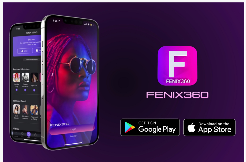
FENIX360 - GEM Global Yield

Under the terms of the agreement, upon Listing, FENIX360 may, at its sole discretion, issue registered and freely tradable common shares to GEM over the investment period, subject to customary conditions. The structure enables FENIX360 to control the timing and amount of capital drawn, aligning funding with corporate milestones and market conditions. As part of the transaction, FENIX360 has also issued warrants to GEM.