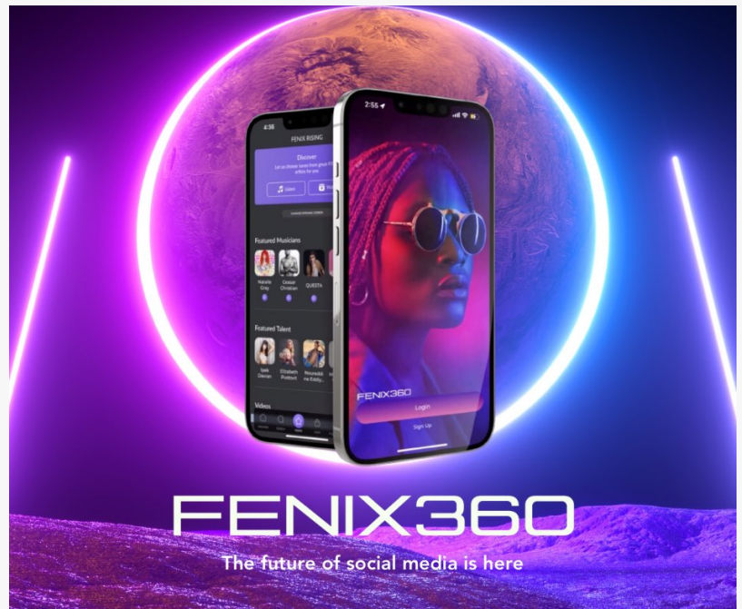
The FENIX360 App