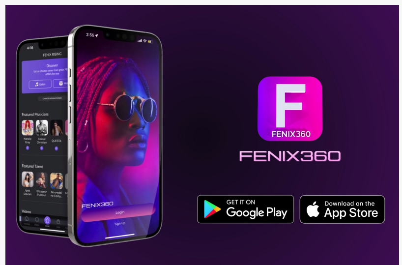
FENIX360 - GEM Global Yield

Under the terms of the agreement, upon Listing, FENIX360 may, at its sole discretion, issue registered and freely tradable common shares to GEM over the investment period, subject to customary conditions. The structure enables FENIX360 to control the timing and amount of capital drawn, aligning funding with corporate milestones and market conditions. As part of the transaction, FENIX360 has also