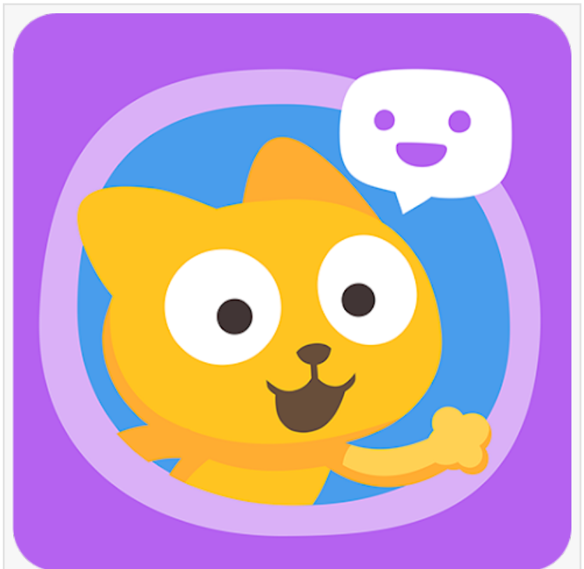
Studycat Learn English App With VoicePlay™