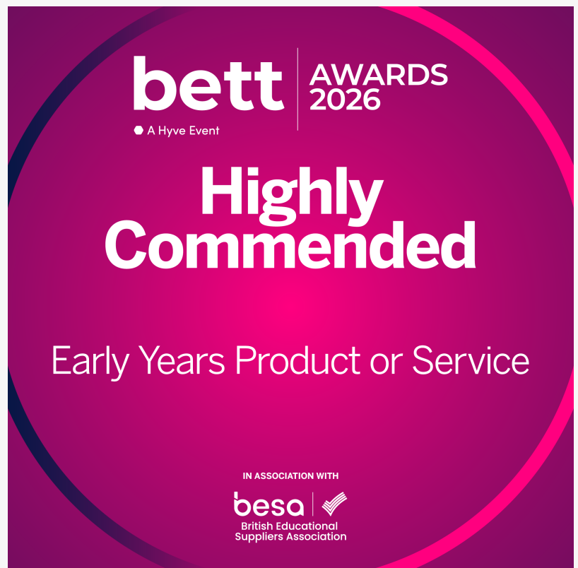
Bett Awards 2026 Highly Commended Badge