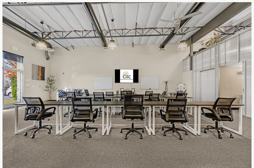
CRC DUI Classroom

ROSEVILLE, CA, UNITED STATES, January 24, 2026 /EINPresswire.com/ -- California Recovery Center (CRC), a trusted leader in addiction treatment and recovery services, proudly announces the launch of its State-Licensed DUI Program , designed to help individuals meet court and DMV requirements while addressing the underlying issues of alcohol use and addiction.