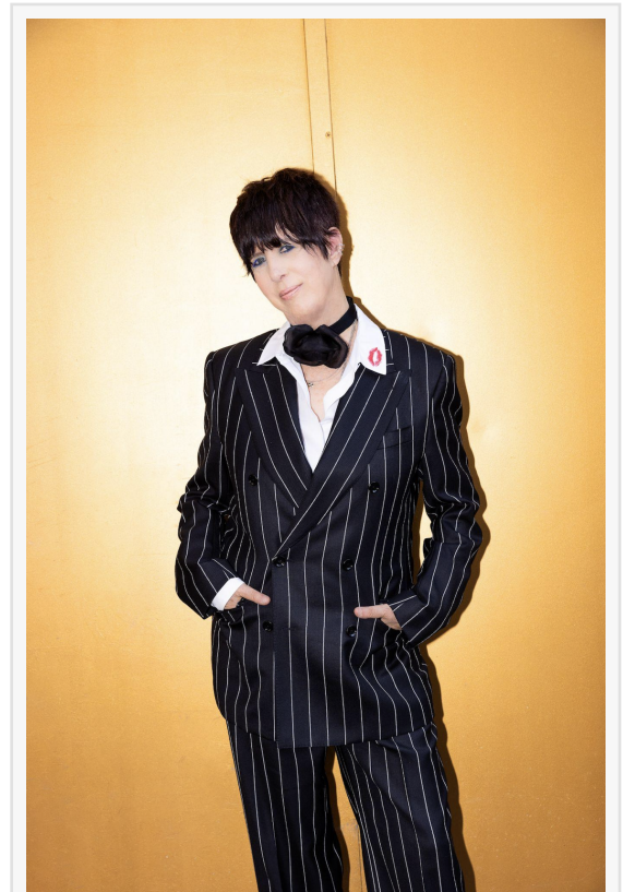
Diane Warren, legendary American songwriter

Over her career, Kesha has earned 10 top 10 singles, billions of streams, two #1 albums, four #1