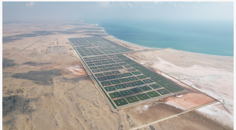
Blue Waters Oyster Farm