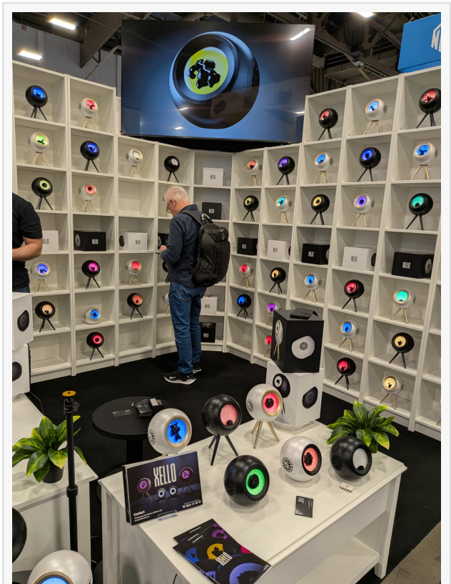
The Xello booth at CES 2026 showcasing Bluetooth speakers that transform audio into visual performance.