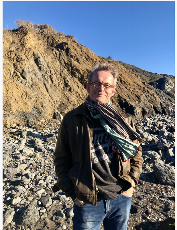
Author Alan Collenette