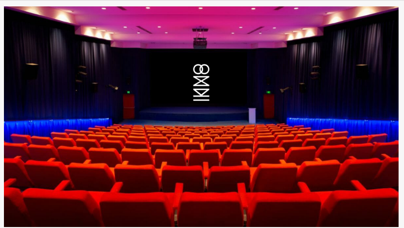
Generative Cinema takes over The Mercury for one night with the OMNI AI Film Festival