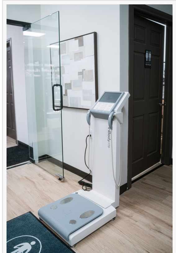
Body Composition Testing in Kitchener-Waterloo

The clinic's Body Composition Test in Kitchener-Waterloo is designed to provide a clear snapshot of key metrics that matter clinically and athletically, including: