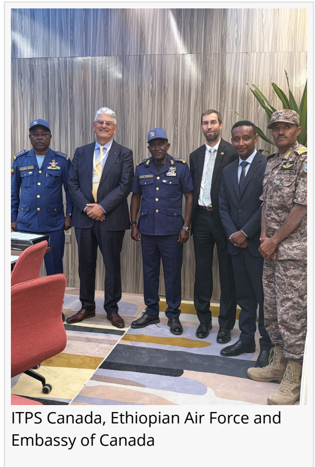
ITPS Canada, Ethiopian Air Force and Embassy of Canada

ITPS Canada has proven experience with the Canadian Commercial Corporation (CCC) to enable secure government-to-government contracting, providing accountability and reduced risk for international government buyers.