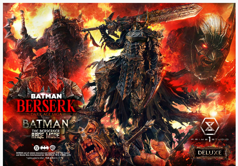
Ultimate Premium Masterline Batman (Comics) Batman: The Berserker Rage Mode

At the base stands Bane, transformed into a demonic figure and pierced by a sword. His