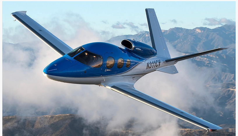
Indiana Donor Network subsidiary TxJet provides aviation and logistics services dedicated solely to organ donation and transplantation partners.