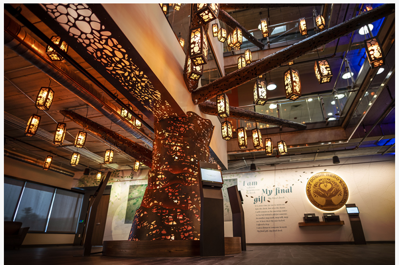
The Donor Memorial at Indiana Donor Network headquarters in Indianapolis, Indiana, honors the legacies of Indiana organ and tissue donors.

One organ donor can save eight lives. One tissue donor can heal more than 75 others. One cornea donor can restore sight to two people.