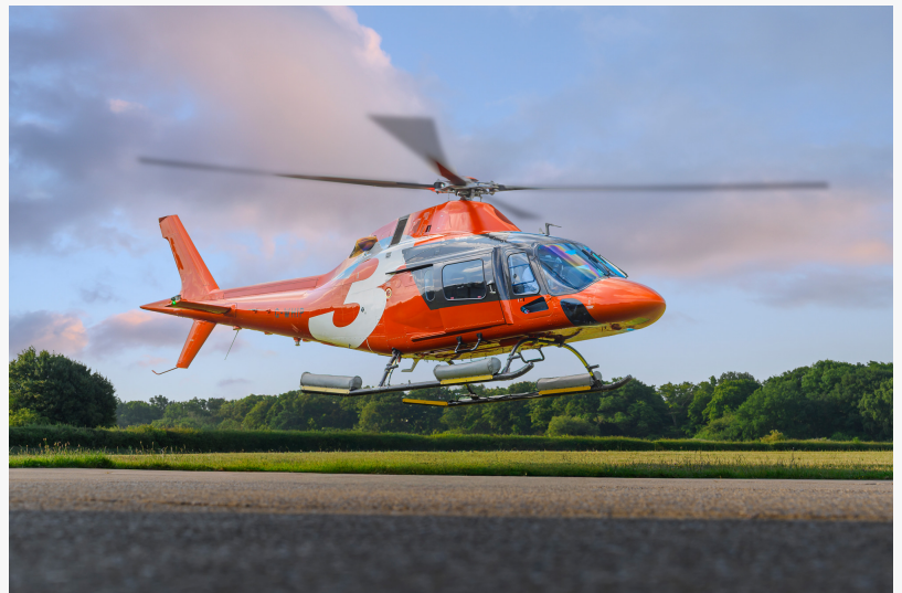
2020 Leonardo A119Kx

The report reveals that supply for sale dropped 26% year-over-year (YOY), while median transaction prices rose 5%. Retail sales volume decreased 7% YOY in units, and increased 6% in value. Absorption rate dropped to eight months at the end of 2025.