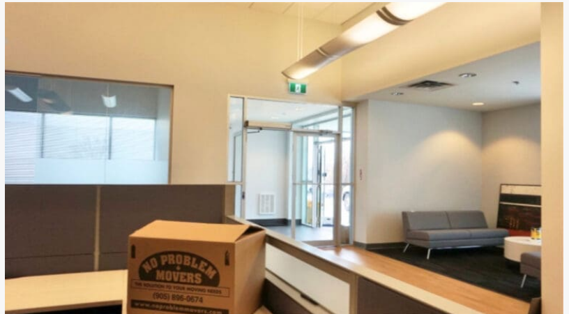
Commercial Moving Services