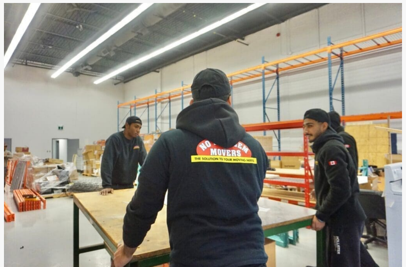
Climate Controlled Storage