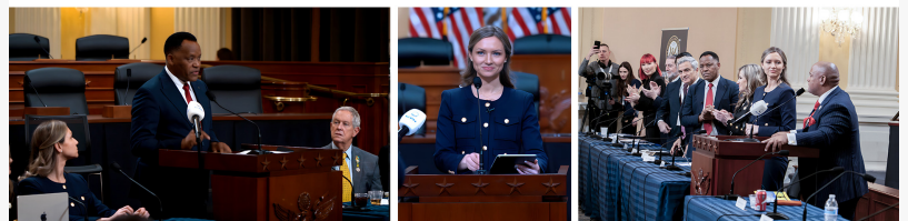
International Interfaith Conference United in Liberty: The Rise of Spiritual Diplomats at the U.S. Capitol Complex